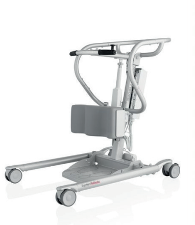
SYSTEMROMEDIC MINILIFT 160

The Hermes 250 Hoist is a folding hoist that can be vertically stored away when not in use. This electrically operated hoist has a greater weight capacity of 250 Kg (39st).