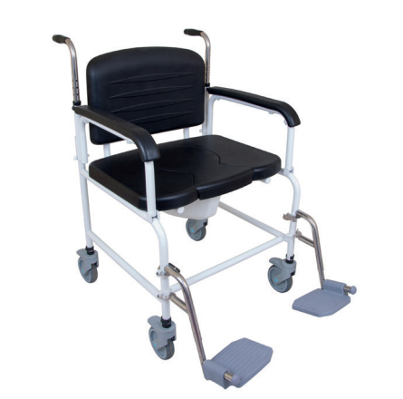
SHOWER COMMODE CHAIR

This perching stool has a reinforced framework in heavier gauge steel to cater for users of up to 318kg / 50st. It comes with fixed back and vinyl upholstery as standard.