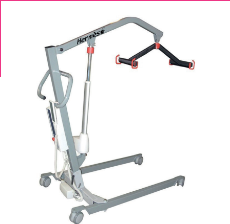
HERMES 250 MOBILE HOIST

Molift QuickRaiser 205 is a state of the art sit-to-stand hoist, with an electrically adjustable leg base and an outstanding lifting capacity. The standing hoist is comfortable, stable and safe with exceptional manoeuvrability.