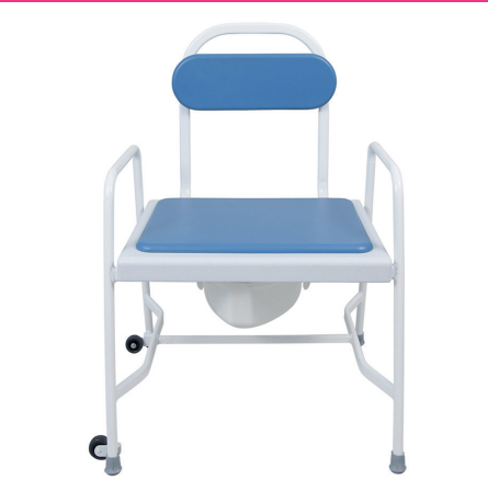
FIXED HEIGHT COMMODE

Safety is paramount when it comes to bathing and toileting to help prevent slips and falls. Independence Mobility offer a wide range of products that are ideal for use in bathroom areas.