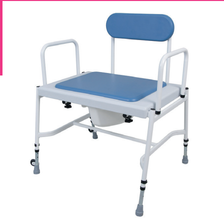
ADJUSTABLE HEIGHT & DETACHABLE ARMS COMMODE

The fixed height bariatric commode is a simple solution to many size predicaments. It is available in a range of options, with a fixed or detachable back and in deeply padded vinyl upholstery or with comfort polyurethane.