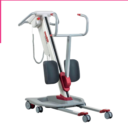
MOLIFT QUICK RAISER 205

With maximum space for the user, the Invacare Birdie offers a truly comfortable lift and transfer to or from beds, chairs or even the floor. The lifters are designed to ensure that folding and unfolding can be carried out easily. The Birdie Evo mobile hoist is also available.