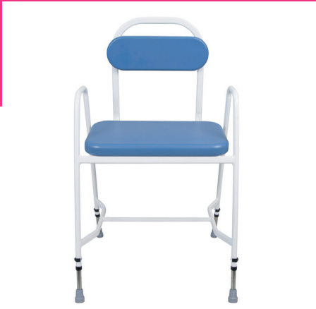
PERCHING STOOL WITH ARMS & PADDED BACK

This bariatric commode has an adjustable height and detachable arms, and is available in a range of options, with a fixed or detachable back and in deeply padded vinyl upholstery or with comfort polyurethane.