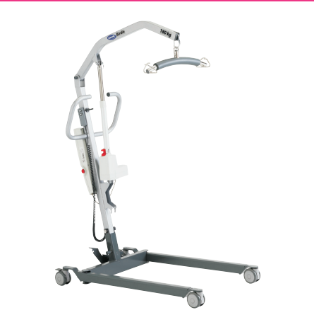
INVACARE BIRDIE MOBILE HOIST

Using the correct type of equipment for client transfers is not only important for the safety of the patient, but also for the caregiver to prevent injury. Our range of moving and handling equipment includes slings and hoists tailored for a wide variety of needs.