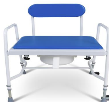
Version pictured is an M221/15/DB/V