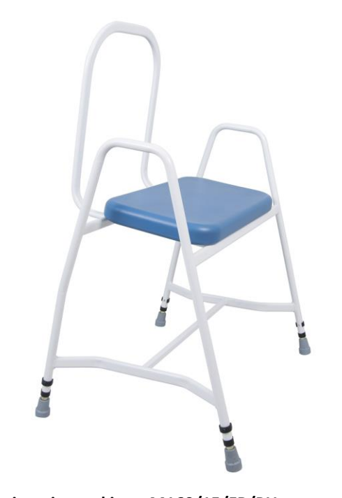
Version pictured is an M160/15/FB/PU

All structural joints are fully welded. As well as providing structural strength this feature also aids product hygiene by reducing the possibility of bacterial entrapment. The steel framework is also coated in an anti-bacterial powder coated finish.