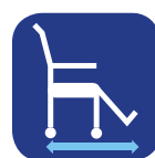
Total depth ▼