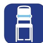
Width between armrests ▼