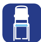
Seat width ▼

For more comprehensive pre-sales information about this product, including the product's user manual, please see your local Invacare website.