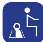
Load capacity ▼