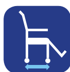
Seat depth ▼