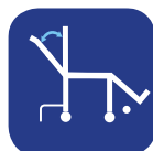
Tilt angle back ▼