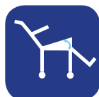
Tilt angle seat ▼