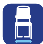
Total width ▼