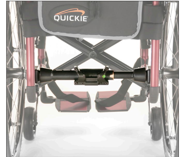
Folding Chair Receiver Bracket and Removable Axle Assembly