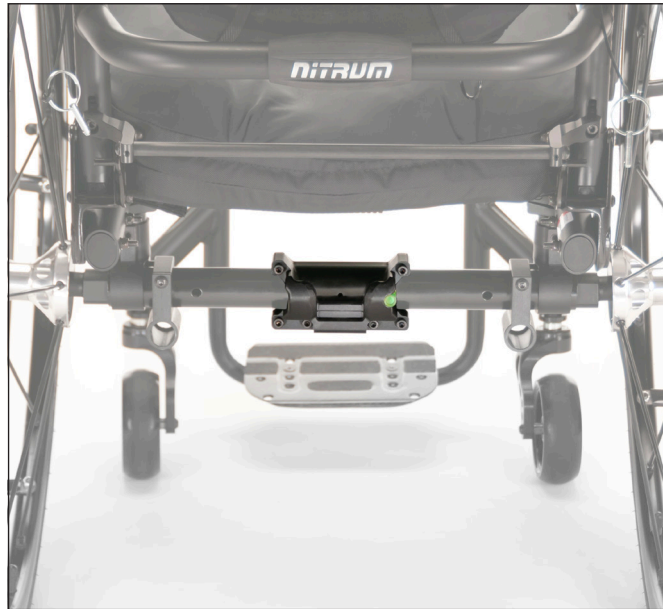
Rigid Chair Receiver Bracket

THE CONTROL BOX can be ordered for either right or left-hand use and can be mounted anywhere on your frame tube.