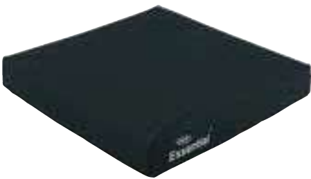
Essential Low profile Essential Basic

The Essential is available in two depths, a 2” depth known as the Essential Low Profile and a 3” known as the Essential Basic .