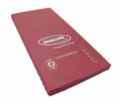
Available in a range of sizes

Cover is multi-stretch, waterresistant and vapour-permeable. A white underside makes it easy to inspect to assist with infection control.