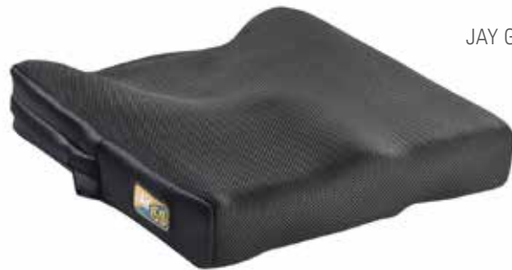
JAY GS cushion

The combination of the JAY Fit Back and the JAY GS Cushion is a perfect seating combination for children and young adults. These two JAY products together are a great option for paediatric clients who require a more lightweight, supportive, adaptable seat system on either a manual, tilt-in-space or powered mobility base.