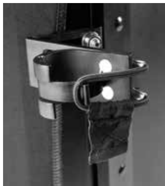
// SNAPTITE HARDWARE