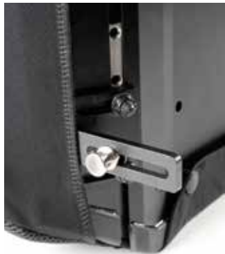
// ATTACHMENT BRACKETS