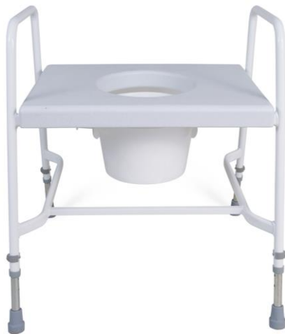
Version pictured is an M152/15

All structural joints are fully welded. As well as providing structural strength this feature also aids product hygiene by reducing the possibility of bacterial entrapment. The steel framework is also coated in an anti-bacterial powder coated finish.